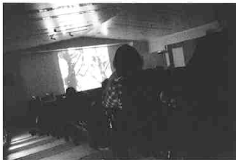
FRENCH PHILOSOPHER JORDI VIDAL's Servitude and Simulacra , co-directed with STÉPHANE GOXE was screened at the Altermodern Prologue. It is at once a filmic essay about contemporary thought, a curated exhibition commented by its author, and a supplement to his book of the same title. VIDAL has produced polemical statements against postmodernism and its reduction of modernism's promise of social equality and justice.

It strikes me that the idea of the altermodern, as it deviates from the limits placed on life and subjectivity by the instrumental violence of modernity, cannot be captured by focusing alone on shifts in locales of practice or by strategies of resistance against domination. The altermodern is to be found in the work of art itself; the work of art as a manifestation of pure difference in all the social, cultural and political signs it wields to elaborate that difference. It is the space in which to fulfil the radical gesture of refusal and disobedience, not in the formal sense, but in the ethical and epistemological sense. Such a stance – what I take to be altermodern – with difference writ large as the fundamental quest of the object of art, can be identified in such diverse works as the installations of Thomas Hirschhorn, the radiant paintings of Chris Ofili, the splayed anatomies of Marlene Dumas, the paintings on animal sacrifice as a metaphor for human suffering by Iba Ndiaye, the 2008 film Hunger by Steve McQueen and many more.