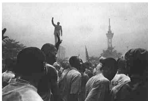
IN HIS LECTURE AND SUBSEQUENT ESSAY, ENWEZOR drew on works such as THOMAS HIRSCHORN's Bataille Monument 2002 [TOP] and [BELOW] GUY TILLIM's Congo Series (this work showing supporters of Jean-Pierre Bemba on their way to a rally in Kinshasa, July 2006).