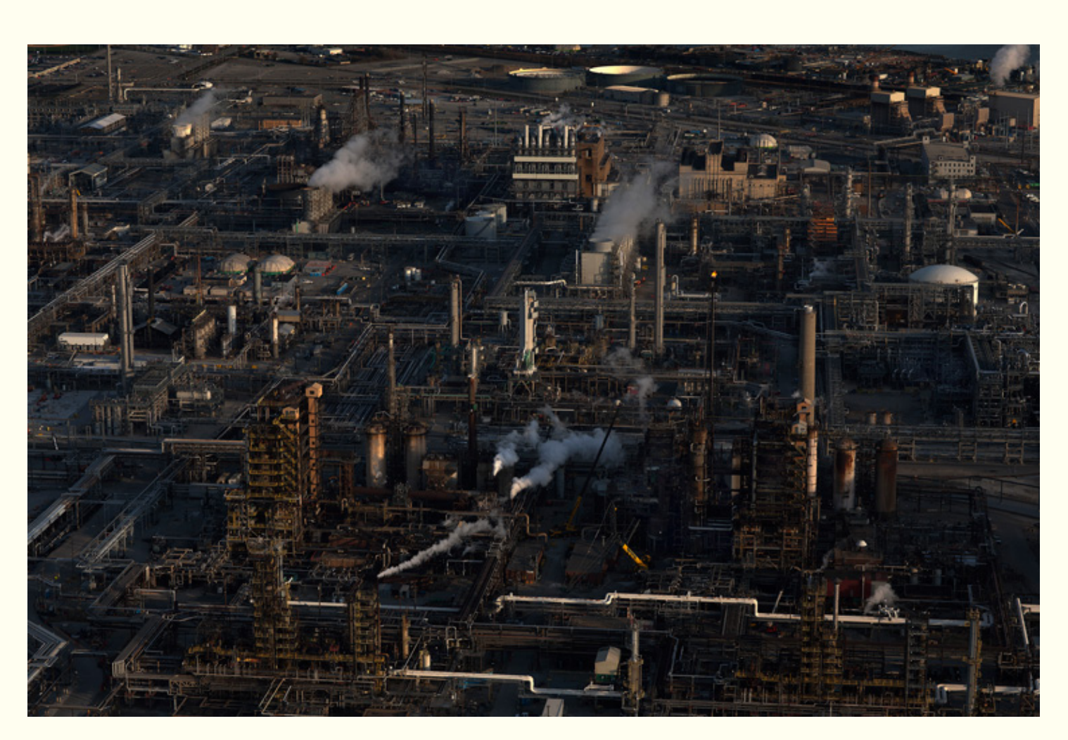
Terry Evans, BP Refinery, Whiting, Indiana, 2015.

the next one. Using high-pressure water jets, the fresh-born stone is cut from the crucible wh ere it was forged. The wet petcoke falls into a pit, from which it is removed by a crane for crushing and transfer to railcars. At BP, the production of petcoke is relentless: up to six thousand tons per day . In Lemont and Joliet, similar operations are carried out at somewhat smaller scales. The question is what to do with all the garbage.