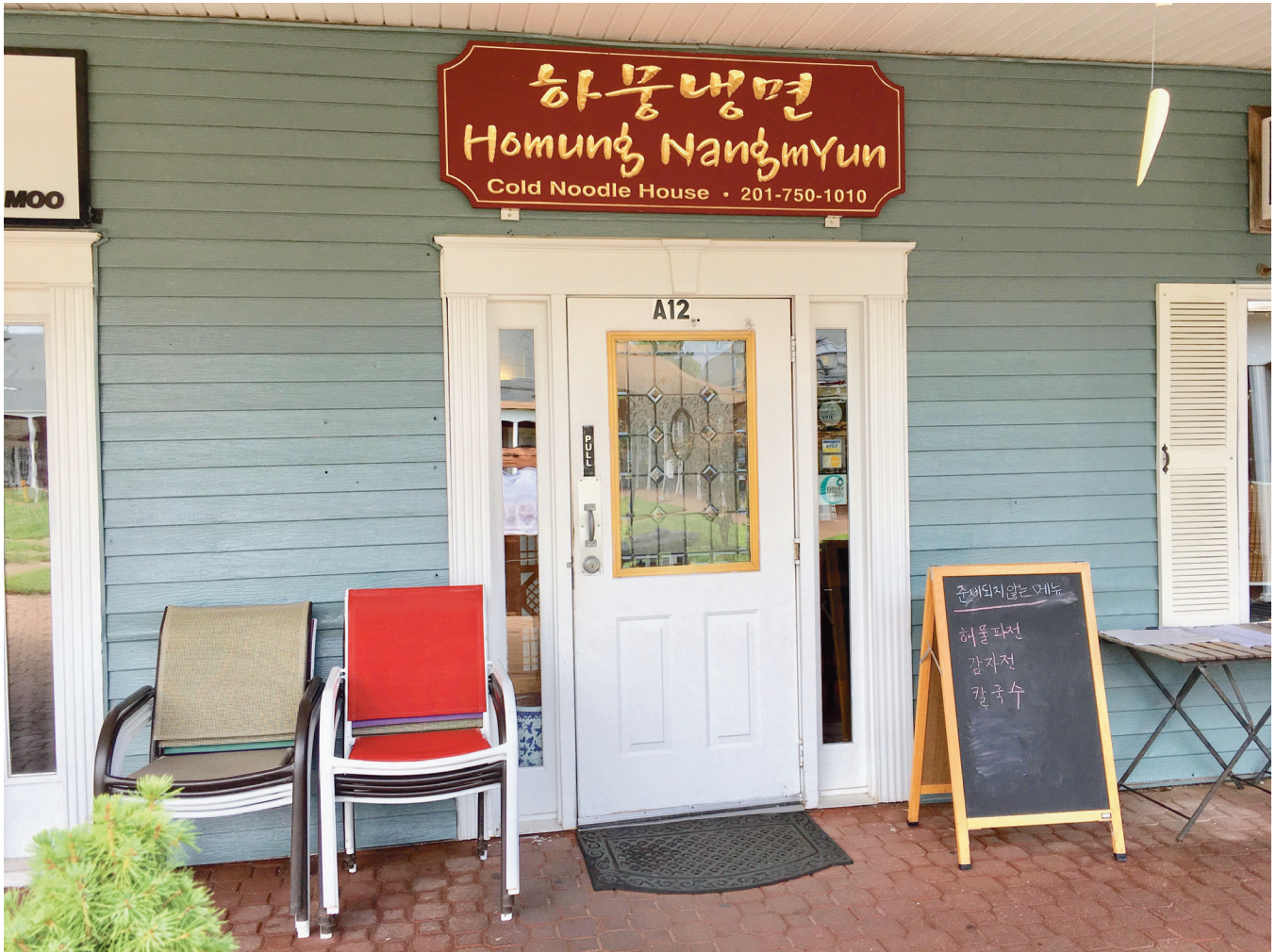
Homung Nangmyun Cold Noodle House 570 Piermont Road Closter, New Jersey 07624