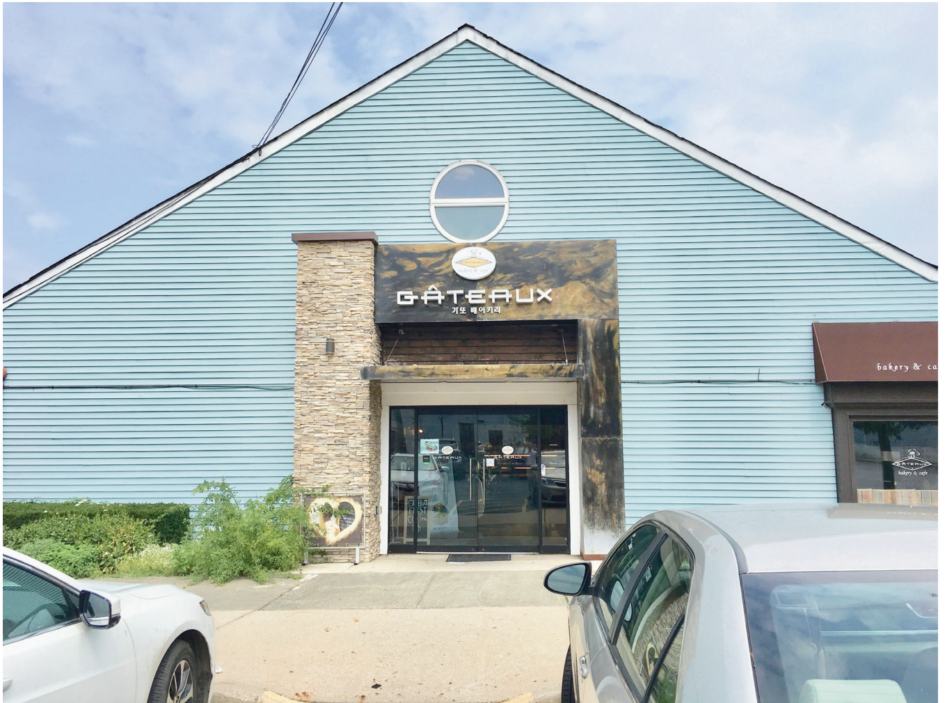
Gateaux Bakery and Café 570 Piermont Road Closter, New Jersey 07624