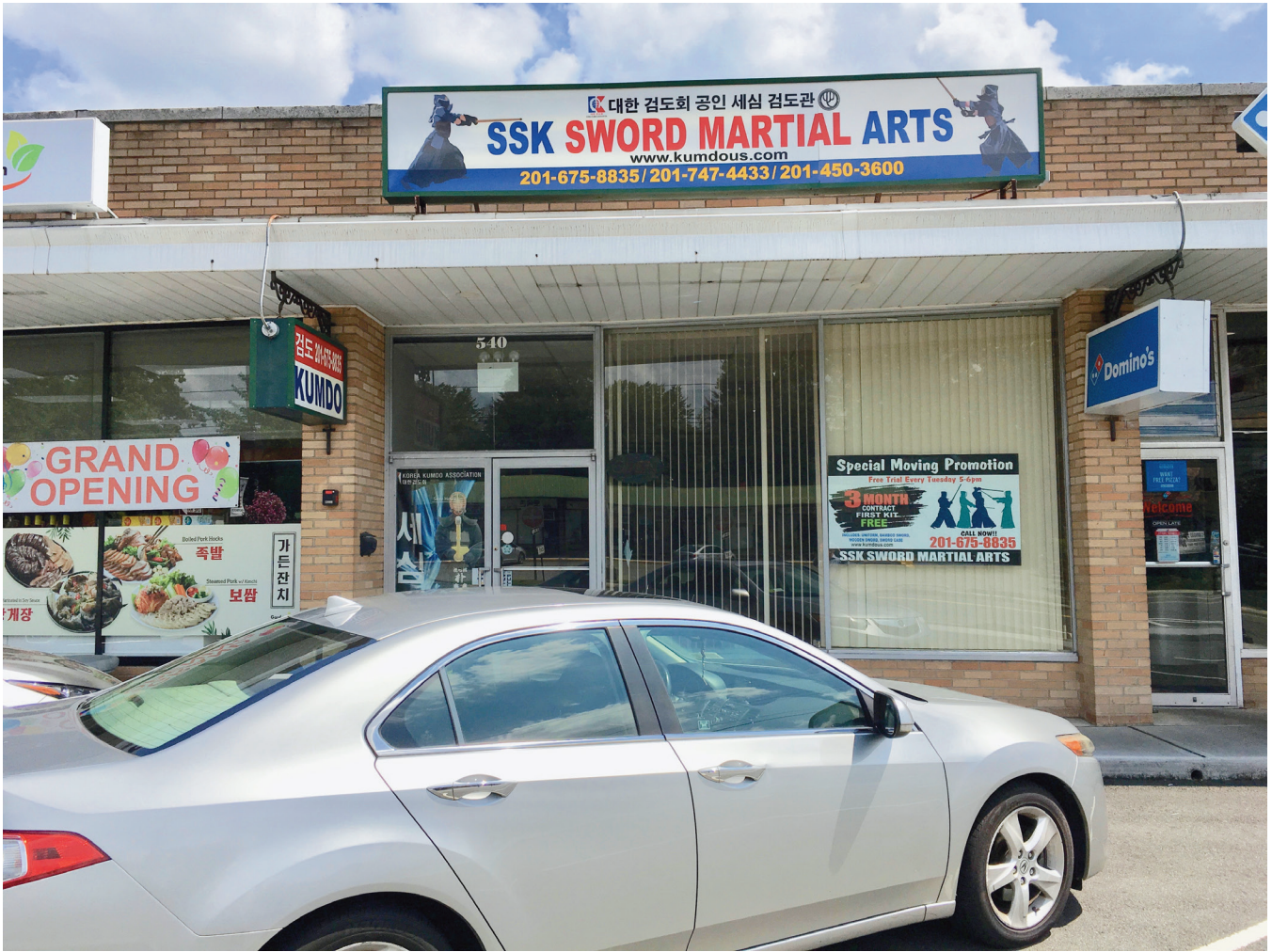
Sae Shim Kumdo Academy 540 Livingston Street Norwood, New Jersey 07648