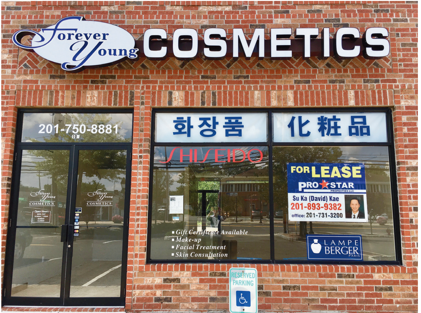
Forever Young Cosmetics 463 Livingston Street, Norwood, New Jersey 07648