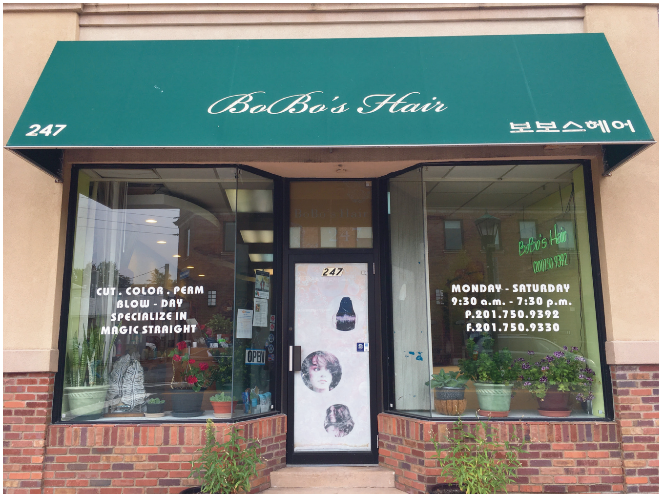
BoBo's Hair Salon 247 Closter Dock Road Closter, New Jersey 07624