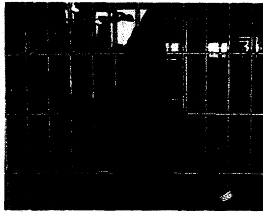
An Iraqi detainee at Abu Ghraib: The horror of what is shown in the photographs cannot be separated from the horror that the photographs were taken.