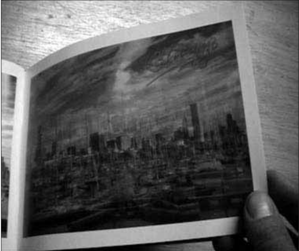
Figure 5. (video still): final page of Sol LeWitt's Chicago (2002), produced in collaboration with Alec Finlay of MorningStar/Pocketbooks.

the visible surfaces has become a standardized form through the use of computer technology. Lev Manovich discusses these perceptions of change and the ways in which ideology naturalizes these changes. This reflects contemporary culture's reliance on appropriation, wherein recycling, re-working, and re-combining media are the standard techniques. He concludes that 'the avant-garde becomes software' and that it continues to introduce revolutionary techniques but the terms are different: