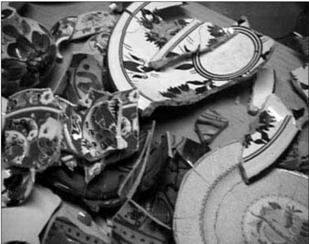
Figure 1. (detail, video still): Yoko Ono's Mend Peace for the World (2001).

There is broad agreement that generative art is a term applied to artwork that is automated by the use of instructions or rules by which the artwork is executed. The outcome of this process is unpredictable, and can be described as being integral to the apparatus or situation, rather than a direct consequence of the artist's intentions. But importantly, the description recognizes that other agencies are at work, including human agency as an integral part of the production process in setting the rules. It is this line of thinking that informed the curation of the touring exhibition Generator (2002/3) , 1 presenting a series of self-generating projects, incorporating digital media, instruction