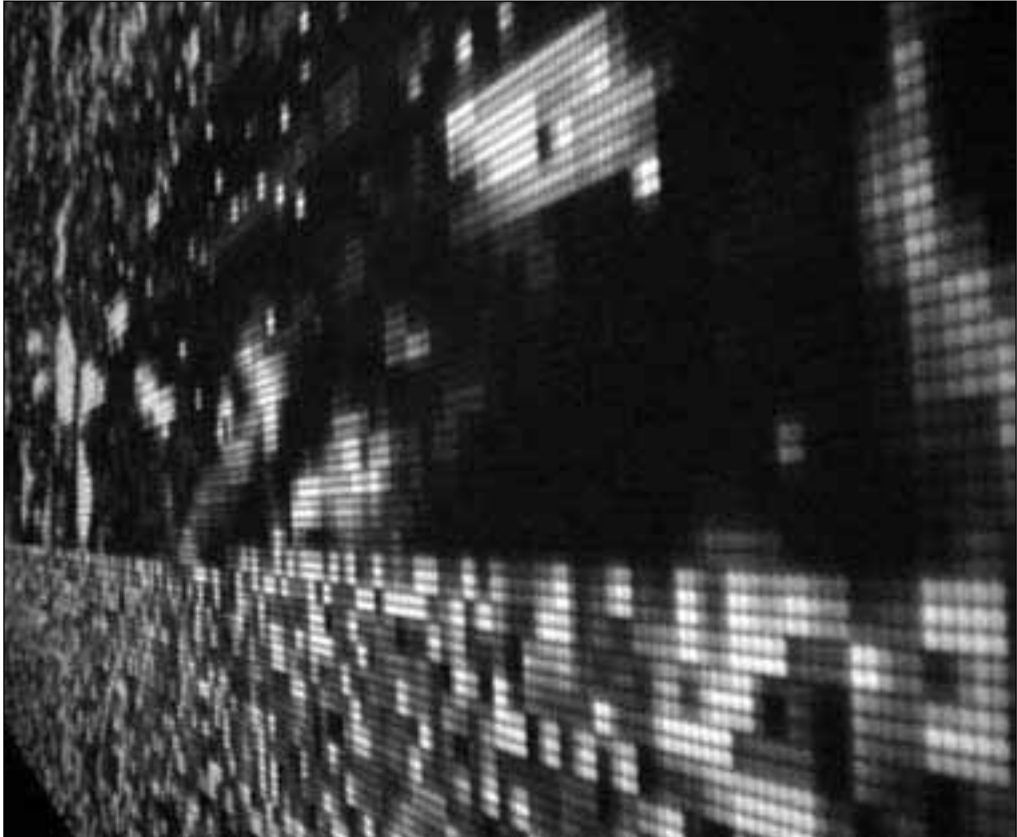
Figure 6. (detail, video still): Stuart Brisley and Adrian Ward's Ordure: : real-time (2002), courtesy of the UK Museum of Ordure.

and Dada). If, as Manovich thinks, software has naturalized montage techniques, how can software be further developed as a radical project in revealing the ideological processes at work?