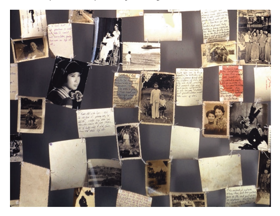
Dinh Q. Lê, Mot Coi Di Ve ( Spending one's life trying to find one's way home ), 1999. Installation view.

practices and critical knowledge. It is also in 2007 that Chung developed in a more systematic way her map drawings based on research.