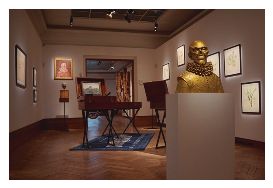
Image: Timoteus Anggawan Kusno, The Untold Stories of Archipelago , 2017. View of the exhibition Power and Other Things: Indonesia & Art (1835–now) curated by Charles Esche and RiksaAfiaty. Centre for Fine Arts Brussels (Bozar), Belgium. 2017.

framework it refers to: trained as an ethnographer, he constantly plays with academic references and ethnographic methods of work in order to question them.