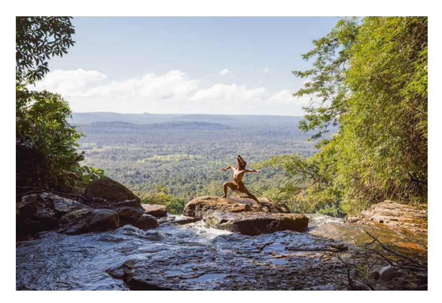
Image 7.1 Khvay Samnang, Preah Kunlong (2017). Still from video.