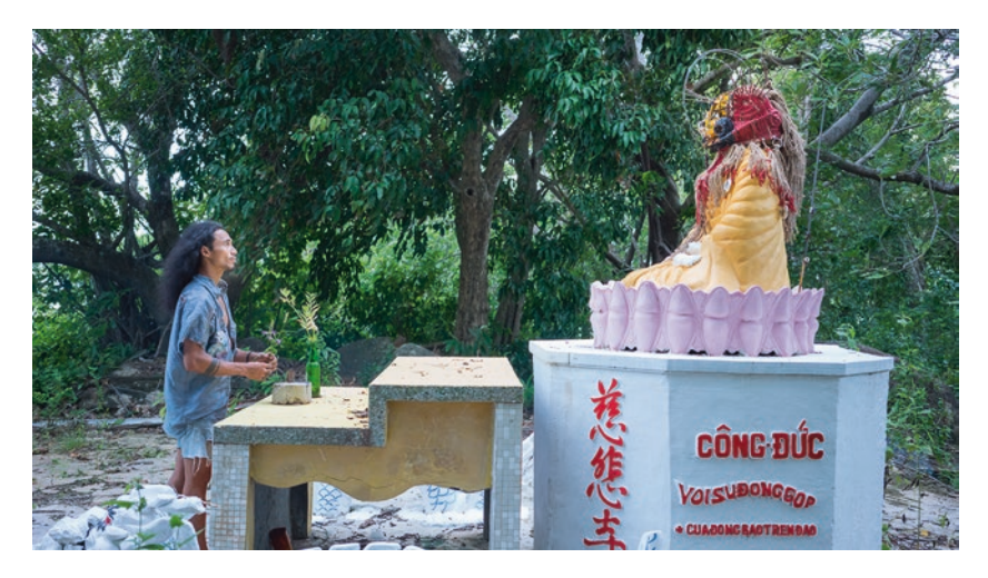
Tuan Andrew Nguyen, The Island (2017). Single-channel video, 42 min. 2048 \times 1080p, colour, 5.1 surround sound. Courtesy of the artist and James Cohan, New York

begins with a voice-over narrating the mythological history of the creation of Vietnam, locating the work in mythical times. Nguyen addresses the question of remembrance and suggests that because of the political choices, and today's denial of the history of the "boat people" by the Vietnamese government, the island, and the events that occurred there, have become a myth.<sup>11</sup> Images of the densely crowded camps alternate with today's empty landscapes and shots of what remains from the commemorative monument, juxtaposed with acted rituals that honour the god of the place and the wanderings of the last survivor of the island who happens to be, in fact, also the last survivor of the world. From this mythical and dystopic perspective, the reality of the camp seems to wane: rather than bringing forth evidence of what happened, the artist, on the contrary, emphasizes the disappearance of the event. "Can the future save the past?" asks the voice-over. The historical facts are here extracted from their academic context and seem to anticipate later research on to how the story of the "boat people" has fallen into oblivion.