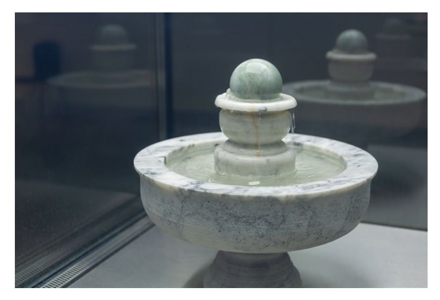
Image: Jiandyin The Alchemy , 2019, C10H15N Human urine, Refrigerated cabinet, Jadeite Ø 12.7 cm., Marble sphere water fountain, Immersion sturgeon waterproof contact microphone, USB audio interface, Controller, 6 sound speakers, Water pump.

the specificities of the empirical knowledge generated by art practices, but, in these cases, the artistic research process is not taken into account.<sup>7</sup> Above all, there is still confusion and a lack of precision regarding the definition of art practices based on research and a scarcity of studies about the original combination of academic and artistic knowledge they generate.