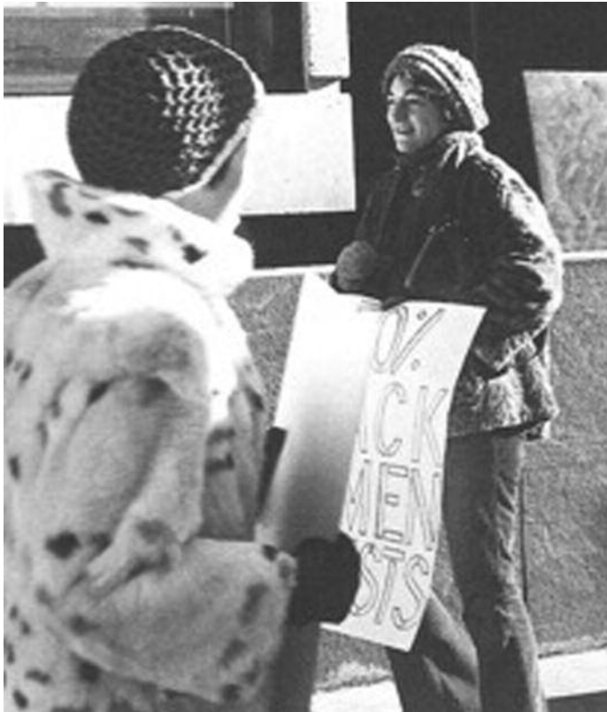
Fig. 3. Lucy Lippard protesting at Whitney Museum of American Art demanding 50 percent representation of women and non-white artists in the Whitney Annual (Sept. 1970).

targeting the Whitney Museum, protesting the low number of women (eight percent in 1969) in their prestigious survey Annuals (Figs. 3 and 4). The group quickly attracted other alienated, isolated women. Employing colorful tactics such as secreting eggs and Tampax plungers marked "50%" around the museum, besieging the museum with telegrams from well-placed supporters, and issuing fake press releases, the group claimed credit for the fact that when the Annual opened December 8, 1970, representation jumped to 20 percent). (Including two African Americans, Betye Saar and Barbara Chase-Riboud, it was the first time women of color had been showcased in a major art museum). 12