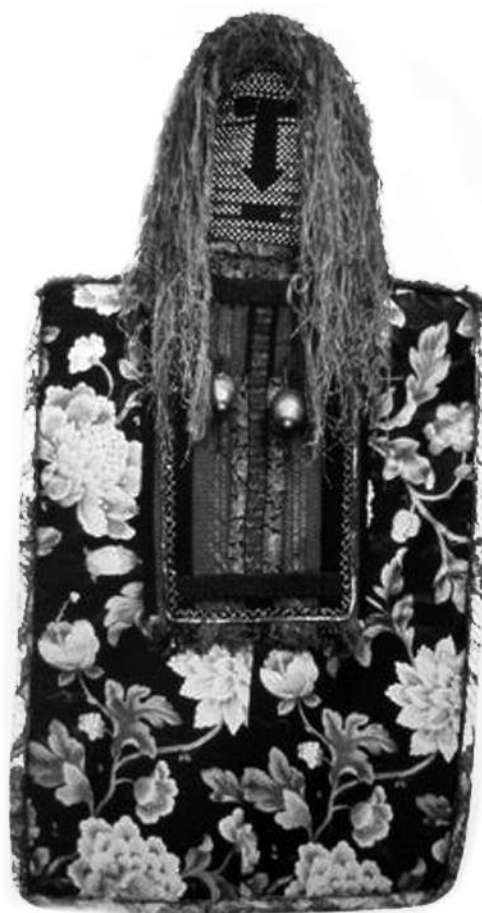
Fig. 2. Faith Ringgold, Women’s Liberation Talking Mask: Witch Series #1 (1973), mixed media, beads, raffia, cloth, and gourds, H. 42”.

In 1969, slightly later than in university departments or the field of politics or literature, ideas set loose by Women’s Lib began tiptoeing into the art world (admittedly haltingly) via the antiwar counterculture, in the form of groups such as WSABAL (Women, Students and Artists for Black Artists Liberation) and Women Artists in Revolution (WAR). 9 “Contrary to the popular image as the wild-eyed radical,” critic Lucy Lippard once observed, “artists are usually slow to sense and slower to respond to social currents.” 10 It is fairly certain that, founded in early 1969, WAR (Fig. 1) was the world’s first feminist artist organization—an offshoot of the legendary antiwar Art Workers Coalition headquartered near SoHo. It was so early that one of the founders, Juliet Mitchell, admits that she had never before heard the term “feminist.” At the time, women were accustomed to being told that things were “not that bad” for them. It occurred to WAR members to canvas high-profile galleries—only to find that “things were much worse than we thought”: one artist in twenty was female. Statistics-gathering, predictably, was to become a staple activity of feminist and other groups (including, two years later, the Los Angeles Council of Women Artists). WAR urged antiwar protest organizations they were part of to include “sexism” as part of their mission. They met with the Museum of Modern Art and the Whitney Museum of