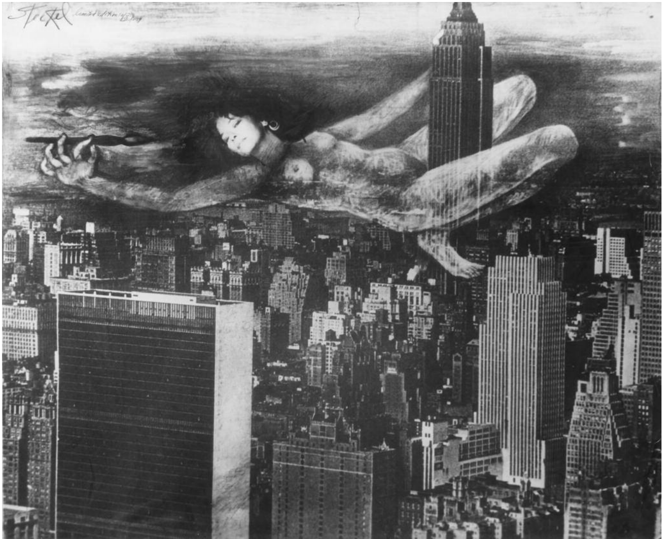
Fig. 9. Anita Steckel, Giant Woman (Empire State) (1973), black-and-white photo collage and pencil on paper, 37" x 49" x 1".

It would be a while before anyone could identify a feminist art overall, but Semmel, for one, identified four thematic ideas that “occur with uncommon frequency in women’s art: sexual imagery, both abstract and figurative; autobiography and self-image; the celebration of devalued subject matter and media which have been traditionally relegated to women; and anthropomorphic or nature forms....” She noted: “The constant recurrence of self-images and autobiographical references in women’s art has paralleled feminist preoccupation with the connections between the personal and the public.” 30