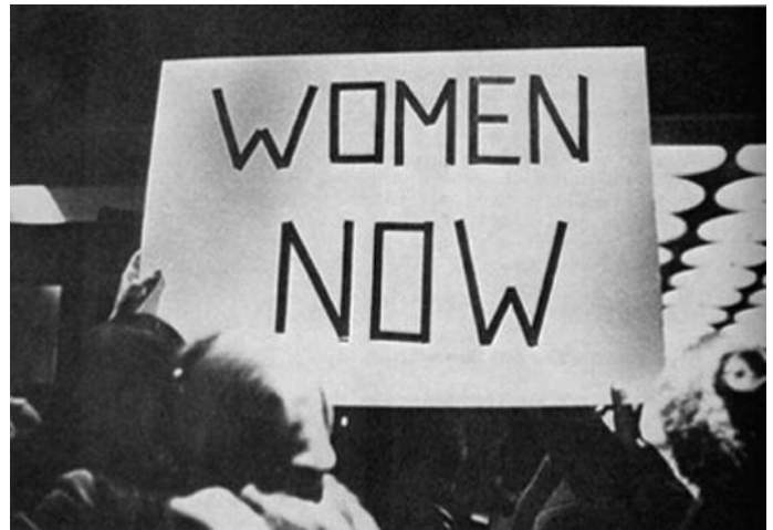
Fig. 4. Women Now, Whitney Annual protest by Ad Hoc Women Artists' Committee (Winter 1970–71).

The demonstration attracted international press, and Ad Hoc, as it was known, became a meeting point for women artists, many of whom, unknown at the time, would go on to have substantial careers, in no small part because of the support and skill-sharing they found there. 13 They adopted a kind of free-form discussion, not exactly consciousness raising, but a forum to vent and share experiences. That meetings rotated between artists' lofts provided a chance to visit studios and see the often quite powerful art on view, helping dispel widely held assumptions about the imitative nature of women's art. The group developed a Slide Registry, collecting examples of women's work from around the country. 14 Galleries, museums, lecturers, and Women's Studies classes could draw from this resource, gaining access to art that, in a pre-internet age, otherwise would remain unseen. Ad Hoc