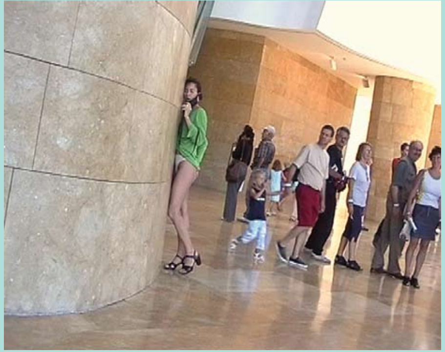
FIG 2: Stills from Little Frank and His Carp, 2001