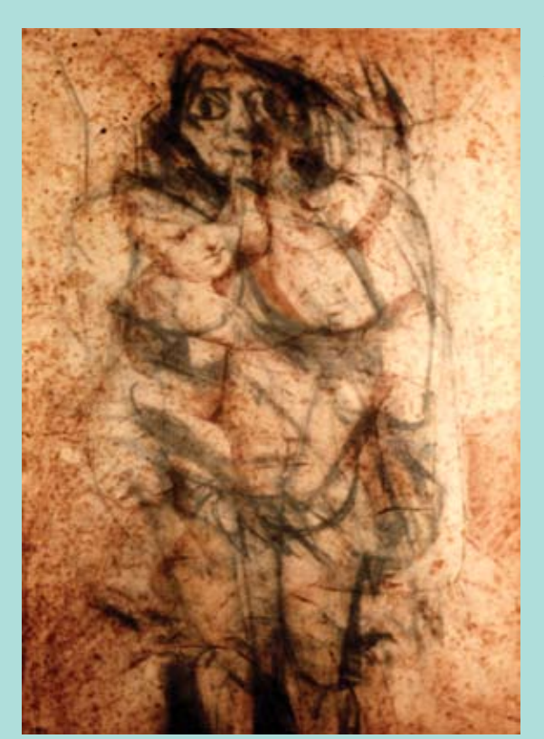
FIG 4: Untitled (de Kooning/ Raphael Drawing) #3, 1984/2005