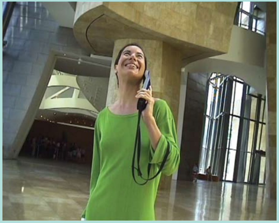
FIG 1: Stills from Little Frank and His Carp, 2001