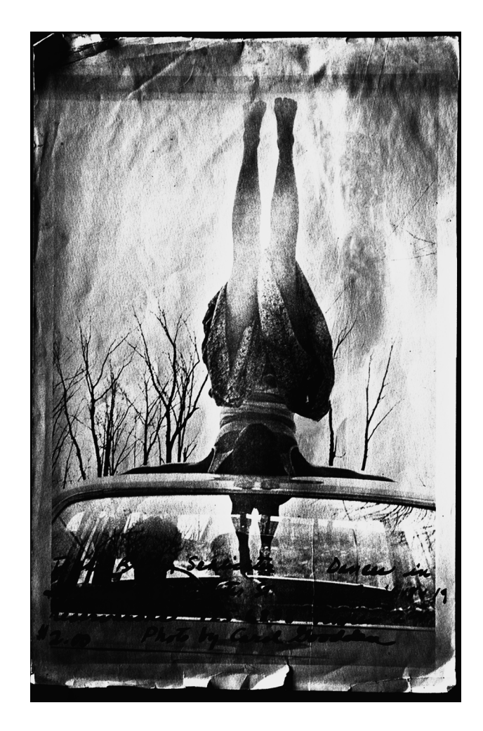
Poster for "Dances in and Around 80 Wooster Street." 1970.

Museet, Stockholm, featured Rauschenberg descending by a rope from the ceiling lights in one of the museum's galleries, which took him, as he performed various tasks, to the gallery's floor. Brown's 1970 use of 80 Wooster Street's façade and interior, as well as the street outside, extended a legacy of Fluxus "street events" presented in SoHo in the mid-1960s.<sup>45</sup>