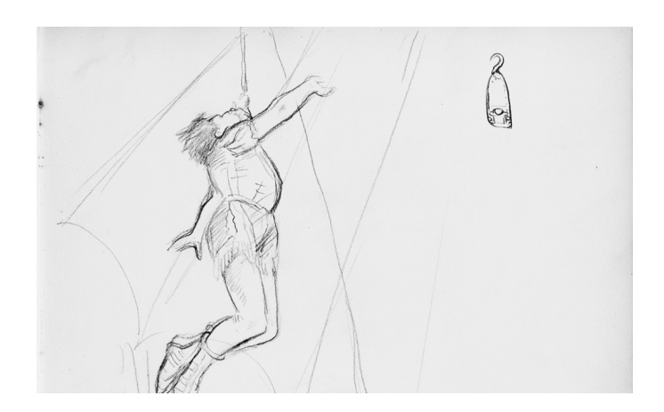
Edgar Degas. Sketch for Miss La La at the Cirque Fernando. 1879.

includes a detailed drawing of the apparatus of the performer's suspension: a wooden plaque hollowed to hold her teeth's bite and attached to a simple hook, the mechanism of her upward lift towards the circus tent's heights. Similarly, Man Walking (2010) revealed not only movement through space but also the apparatus that made such movement possible. The walker was lifted while trying to exert her or his weight to walk downward, producing a succession of actions and cognitive decisions whose deployment—by gravity, by the belayers, and by the performer—was visible to the audience.