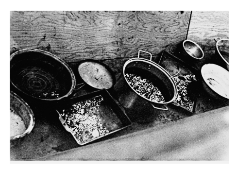
Brown. The Stream. 1970.

Brown's path from 80 Wooster Street to the Whitney Museum was anticipated by the logic of Man Walking , and the new interest in temporality on the part of museums underpinned her Whitney Museum program, "Another Fearless Dance Concert." In this context, Brown reconfigured the piece as Walking on the Wall (1971). Seven dancers, suspended from the grid of the Whitney's ceiling, walked across two perpendicular gallery walls. Without the determining limit provided by architecture, this activity was not object-like: instead, walking is defamiliarized as a group process enacted across two surfaces of an implied open cube.