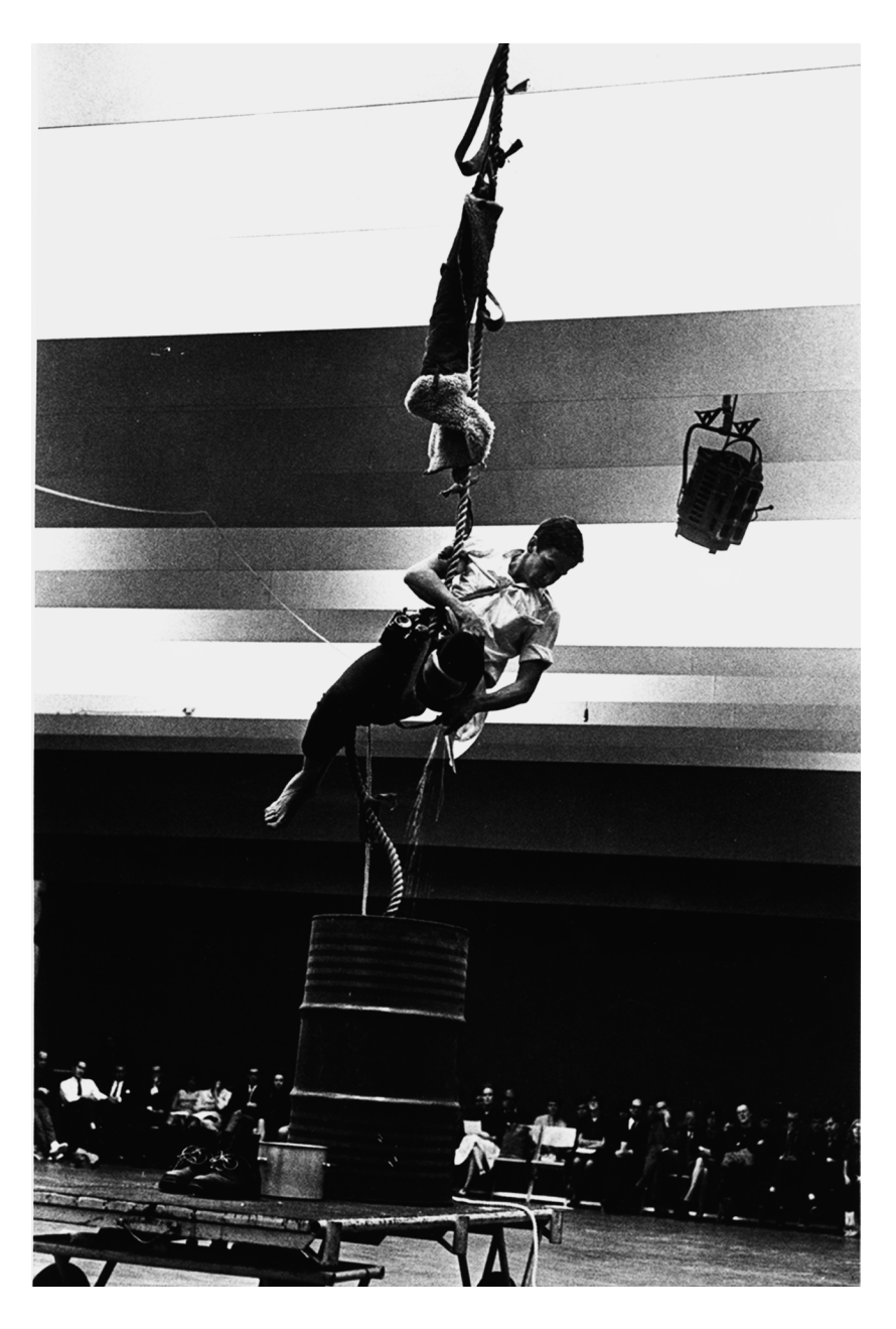
Robert Rauschenberg. Elgin Tie. 1964.