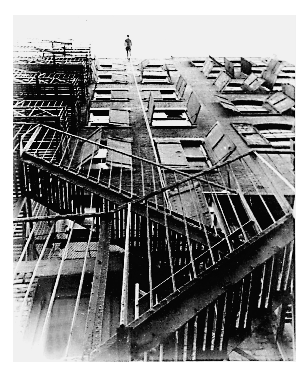
Trisha Brown. Man Walking Down the Side of a Building. 1970.